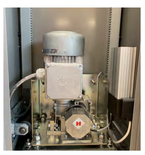
Motorisation Sleipner and heating element.