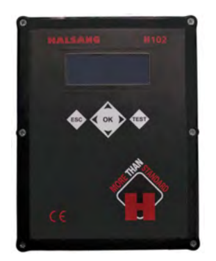
Electrical cabinet with a Halsang H102 controller and frequency modulators