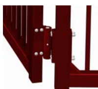
Machined hinge, withstands a load of 400 kg