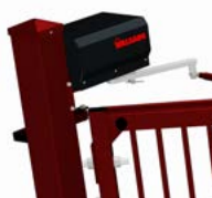
Worm geared motor with hollow sleeve.

The gate posts are manufactured in hot dip galvanised + RAL coated, high grade steel (in accordance with EN ISO 1461) and the gate wings are manufactured in RAL powder coated aluminium. The construction is very robust and the gates are developed for the Nordic climate.