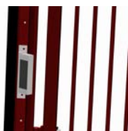
Electro magnetic lock.