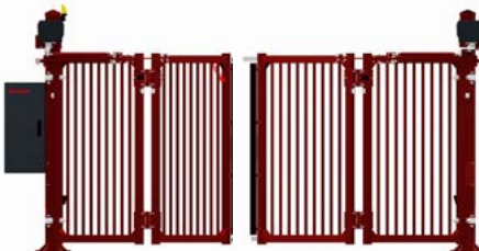
Aluminium – Double wing