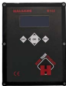
Electrical cabinet with a Halsang H102 controller and frequency modulators